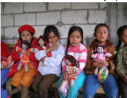
Yanamayo girls hug the rag dolls the team brought them as gifts.

This month we hosted a team of ten from Spring Arbor, Michigan who came to continue the church building in Yanamayo that another Spring Arbor team and local church people started last year. They were able to accomplish quite a bit including pouring a cement floor, making stairs to the second floor, and laying block for the second floor walls half-way up.