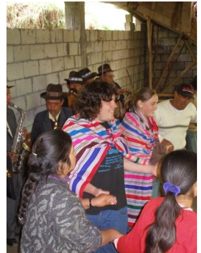
Church members and team members dance together to the music of the orchestra.

In addition, they organized a children's rally (complete with an Easter egg hunt) and taught arts and crafts activities. All that called for a celebration! The church people were happy to help the team members kick up their heels and say thank you to God for what He had accomplished through all of them.