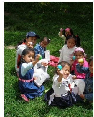
These Tarma Sunday School kids found their Easter eggs!