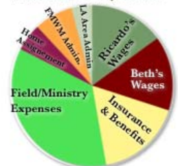
Where the Money Goes...

As always, we thank you so much for your ongoing support of our ministry - through your prayers, notes and financial gifts. It is truly that support that makes our ministry possible, here at Comunidad Cristiana Casa Grande , in Chile and throughout all of Latin America.