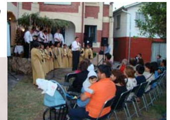
Nazareth (Mary, Magi) shared some of