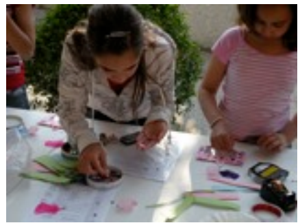
These are pictures from the Kick-off and first couple of weeks of P- Town English Club.