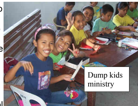
Dump kids ministry