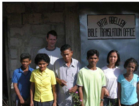
Ayta Abellen Bible translation team

By the end of this year we anticipate translation being in progress for three Ayta languages. It is exciting to watch the different committees form and get started as we look forward to the day when the different translators will meet together regularly for times of fellowship, training, and collaboration. Here is the current status for each of the three groups: