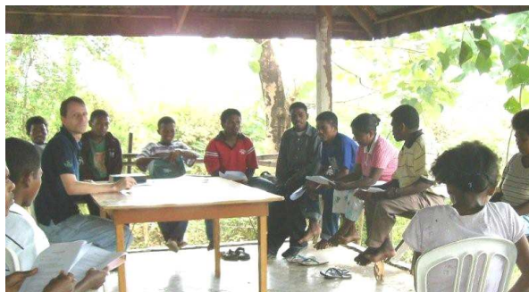
Meeting with the Ayta MagIndi Bible Translation Committee in February

Lord, we rejoice to see Your Ayta people rising up to translate Your Word into their own languages so that other Aytas will hear Your Word, understand its truth, and worship You.